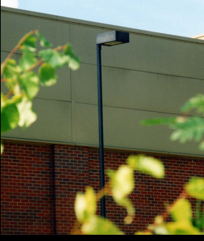
Well directed, sensor-operated, not too bright

(CPRE) Night Blight – CPRE (The Countryside Charity) has useful local, regional and national maps of England's light pollution and dark skies. www.cpre.org.uk