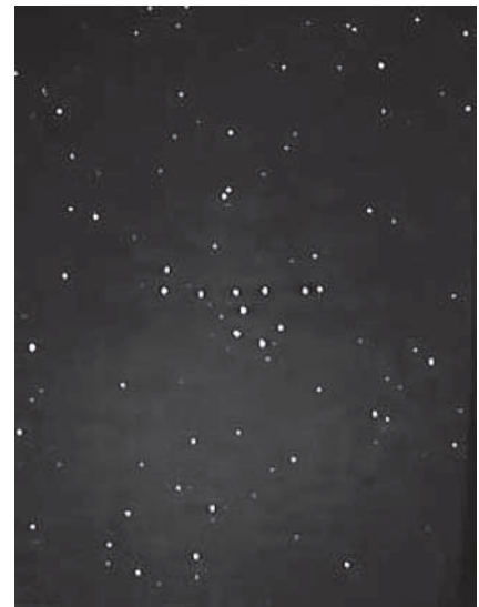
Figure 3. NQ Vulpeculae (Nova Vulpeculae 1976), 300mm telephoto lens, photographs by Peter Birtwhistle. Left: pre-nova, 1976 July 28; right: nova present, 1976 Oct 23.

those fortunate enough to own a CCD, attaching a 50mm lens (with appropriate space tubes), allows instant images to be obtained. Unfortunately the field of view is usually smaller as in the case of the MX516 used by the author which gives a 5° area, and therefore more images are needed to achieve the coverage of a photograph (Figure 2).