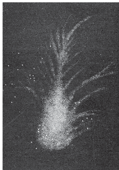
Lord Rosse's drawing of M1, the 'Crab' nebula, probably the origin of the name.

Moving onto groups of stars, the speaker had found definitions of the word 'asterism' somewhat elusive in the astronomical literature, but the word was increasingly in very common usage. Many such groupings were of ancient origin, such as the Plough, the Little Dipper or the Square of Pegasus. Each helped to highlight a prominent area of a constellation, and were useful celestial signposts. The most ancient qualifiers for such status were usually open clusters, such as the Pleiades, the Hyades, Praesepe and Coma Berenices. Some of these names could be traced back beyond the earliest literature we have, for example, Homer made reference to the Hyades cluster in his writings. Other asterisms, such as the Summer Triangle and the Teapot in Sagittarius, were more recent additions, the former having been coined by Sir Patrick Moore. Many newer additions were so faint that they had not warranted much attention before the telescopic era, but now provided instantly recognisable and invaluable signposts to asteroid and nova patrollers. The speaker's personal favourites included Brocchi's Cluster, named after a chart-maker at the AAVSO at the turn of the 20th century, Dalmiro F. Brocchi, though now often called by its conformational lookalike, 'The Coathanger'. Another favourite was Kemble's Cascade, a group of 20 stars in the