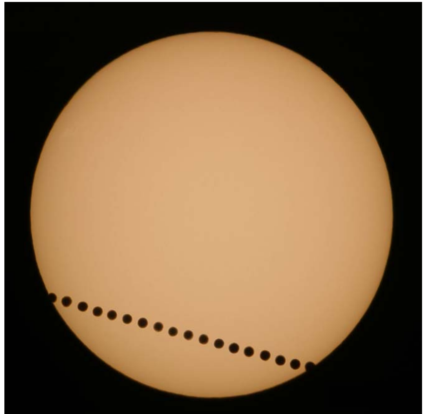
Transit mosaic by Nigel Evans in Sharm el Sheikh, Egypt, using a Canon 10D digital camera with 1000mm lens and \times 2 converter. Images were made at 20 minute intervals. N. S. Evans

This special edition of the BAA Journal , with its associated CD-ROM (see below), has been compiled to commemorate the event, and to bring the