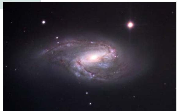
Messier 66. 250mm TEC Mak-Cass at f12 + ST10XME CCD camera.