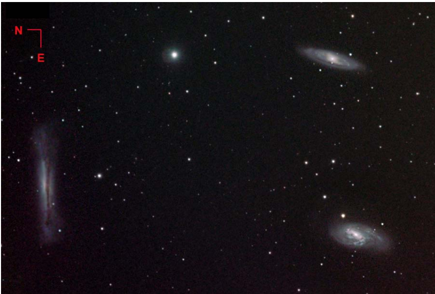
The Leo Triplet, M65, M66 & NGC 3628. TVNP101 APO refractor + Starlight Xpress HX916 CCD camera with ST4 autoguider. IDAS LPR filter & True Tech RGB colour filters. Image by Peter Carson.

Lying due south around 21:00 UT in April, the constellation of Leo is a recognisable grouping of stars even to people with only a passing interest in astronomy. To deep-sky observers Leo means galaxies; many of them bright and showing detail in only moderate apertures. Leo contains five Messier galaxies, all lying below a line joining \beta (Denebola) at the Lion's tail, to \alpha (Regulus) at the base of the 'Sickle' asterism. Roughly halfway along this imaginary line is the grouping of M95, M96 and M105. These galaxies are all readily visible in a 150mm reflector, with the barred spiral M95 and the spiral M96 fitting inside a 1^\circ field circle and the elliptical galaxy M105 lying 1^\circ to the northeast.