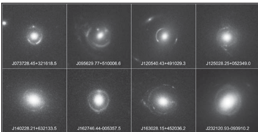
A gallery of Einstein Rings, gravitationally distorted images of distant galaxies, imaged in 2005 by the Advanced Camera for Surveys on the Hubble Space Telescope.