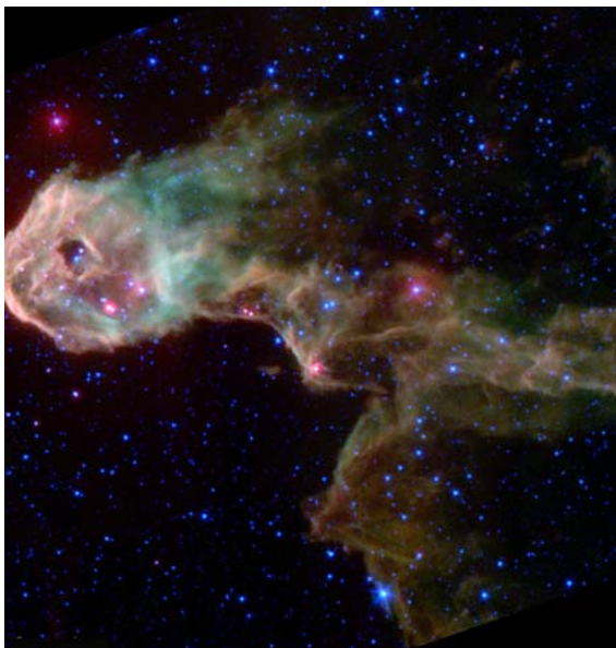
Spitzer reveals proto-stars in part of IC 1396, the Elephant Trunk Nebula, which is opaque to visible light.

seemed to form preferentially in dusty regions, M42 being a prime example. The optical opacity of such sites limited the amount which could be learnt about them at visible wavelengths; much more could be learnt from their dust emission – its temperature and morphology.