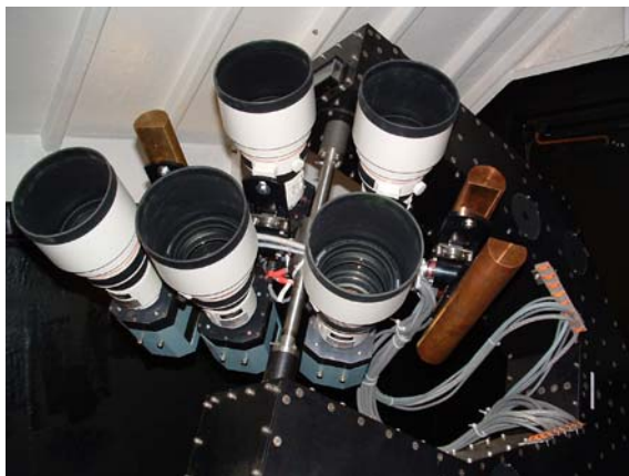
Five of the eight cameras of one of the SuperWASP units – mountings for the remaining cameras can be seen alongside.

until 2020. The Darwin observatory – a space-based constellation of four telescopes planned by ESA – would not only image exoplanets, but also take their spectra. This would allow the composition of their atmospheres to be studied. Atmospheric scientists had identified certain features, termed biomarkers , which, if detected in an exoplanet spectrum, were thought to be sure indications of the presence of life. One example was ozone – O_3 – which indicated the presence of free oxygen atoms in a planet's atmosphere. Over time, one would expect free oxygen to react with rocks to become bound up in minerals; a continuing supply indicated replenishment and in turn respiring organisms. As with the ELT, however, Darwin's work was some years distant: it was scheduled for launch around 2015. The remainder of this talk, therefore, would look at what was possible with current instrumentation. There were indirect techniques for detecting exoplanets, which did not obtain images of the planets themselves, but which inferred their presence by detecting their influence on their host stars.