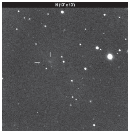
Comet 2P/Encke imaged by Martin Mobberley on 2007 February 6. Celestron 14 + SBIG ST9XE CCD, 4 \times 120 secs.

Looking ahead, the 40m Extremely Large Telescope (ELT), proposed by the European Southern Observatory (ESO), would be able to image planetary systems similar to our own, but it was not scheduled to be built