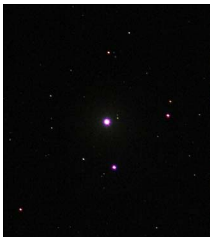
Vesta imaged on 2010 February 18 at 21h 25m UT. A 20-second exposure with a Nikkor 135mm f/2.8 lens, ISO 400. Vesta appears to the right of Algieba (with 40 Leonis, mag. 4.8, below) and is the third brightest object in the field.

There was a Vesta (mag 6.1) 'spectacular' on 2010 February 17 when the asteroid passed