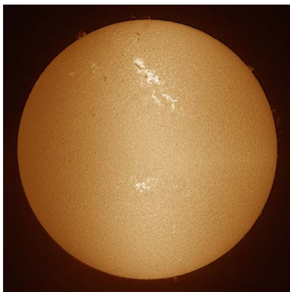
Activity on the Sun imaged by David Arditti on 2011 March 2 using a B1200 blocking filter.

On April 7 there is an occultation of the 4th magnitude star 37 Tau, shortly followed by that of 39 Tau, which is somewhat fainter at mag 5.9. And on April 15 there will be an