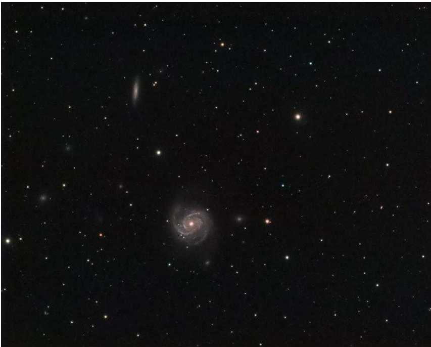
M100 imaged by Peter Carson using a 100mm refractor and a Starlight Xpress HX916 CCD camera. Total exposure 1h 18m: 55m luminance 1x1 and approx 7m each colour binned 2x2. Luminance sub-exposures 5 mins long. Taken at Kelling Heath Spring Star Camp, 2008.

is thought to be in a small group with M94, and a few other galaxies in Canes Venatici, though some may be poor associations.