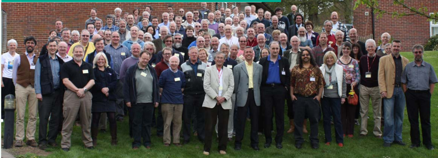
Group photo at Winchester 2011